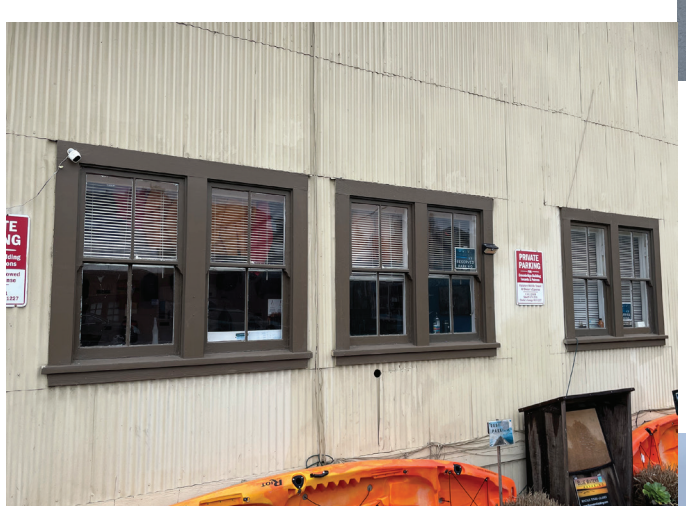
Historic window fabric and placement, January 21, 2024.