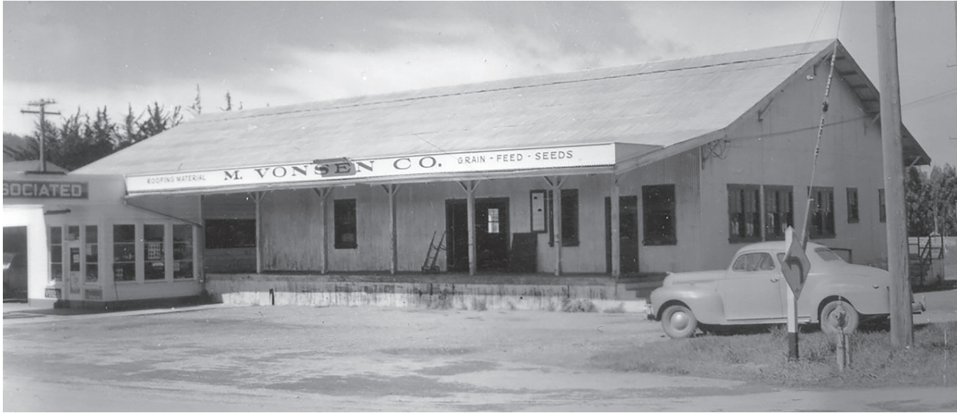
Two views, taken on the same day circa 1948. The service sation section has been remodeled, but most of the remaining building possesses a high level of integrity.